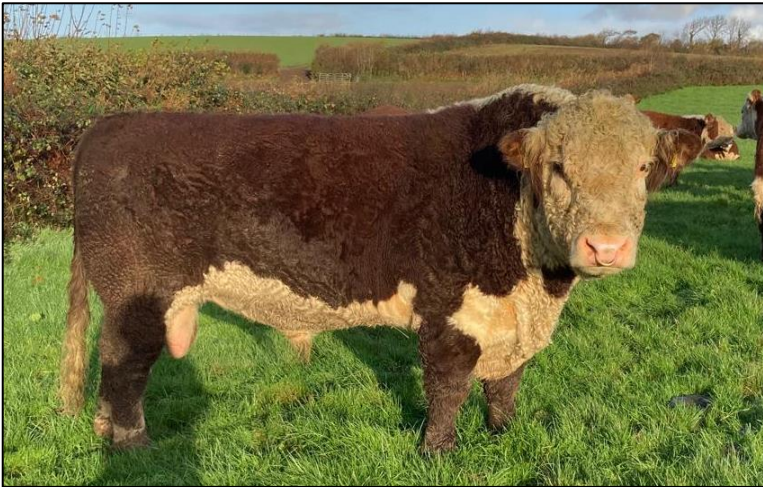
"Solpoll 1 Vegas (P)"